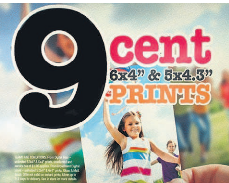
Photo Kiosk Special Offer

9cent 6x4" & 5x4.3" PRINTS Offer available until May 18, 2018 Conditions apply The Wairoa Star Queen Street Phone 838 7194