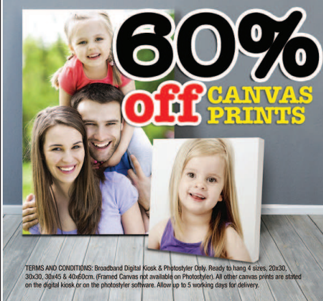
Photo Kiosk Special Offer