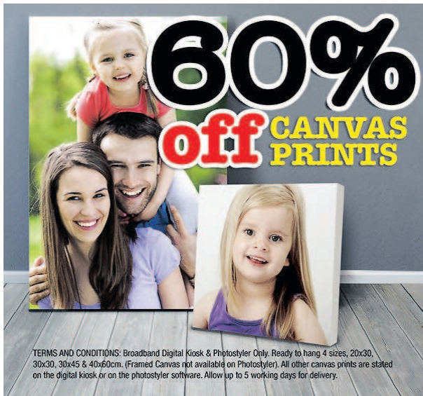
Photo Kiosk Special Offer

TERMS AND CONDITIONS: Broadband Digital Kiosk & Photostyler Only. Ready to hang 4 sizes, 20x30, 30x30, 30x45 & 40x60cm. (Framed Canvas not available on Photostyler). All other canvas prints are stated on the digital kiosk or on the photostyler software. Allow up to 5 working days for delivery.