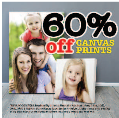
Photo Kiosk Special Offer

Offer available until November 23, 2018 Conditions apply