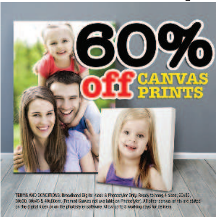
Photo Kiosk Special Offer

Offer available until November 23, 2018 Conditions apply