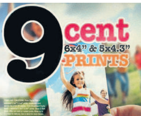
Photo Kiosk Special Offer

Offer available until May 17, 2019 Conditions apply