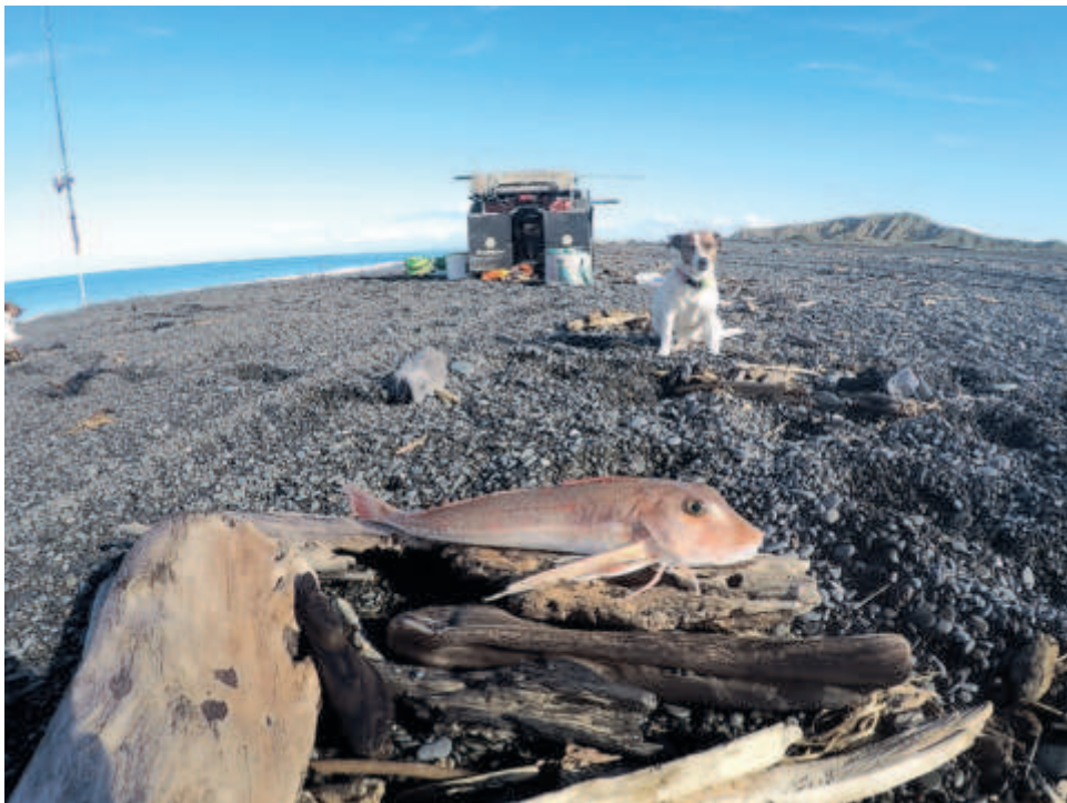
Whakaki fishing at its best! Level 3 surfcasting!