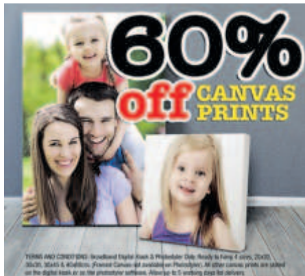
Photo kiosk Special

Offer available until August 7, 2020 Conditions apply