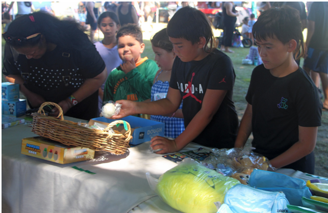
PLENTY TO CHOOSE FROM: Tamariki eye some toys to treat themselves at the popular Waitangi Day event in Wairoa.