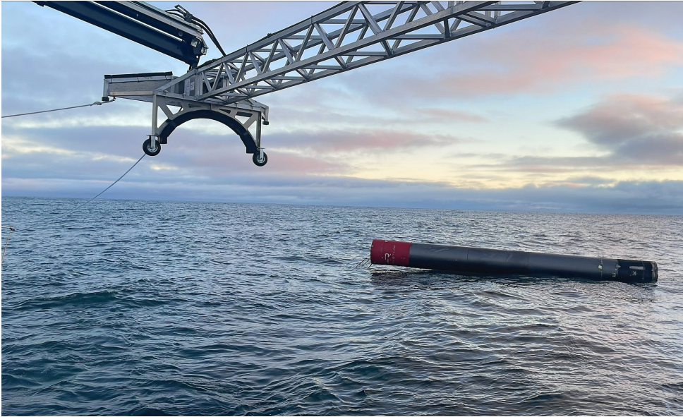
FIRST LAUNCH OF 2024: Electron's first stage ready for recovery operations to retrieve it following a successful return to Earth from space.