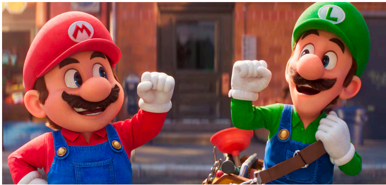
SHOULD KEEP YOUNG EYES GLUED: Nintendo's game icons — Mario and Luigi — leap on to the big screen in The Super Mario Bros. Movie.